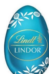
Lindt salted caramel egg