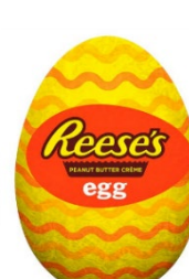
Reese peanut butter egg

Whose name would you like in front of your carrot? It could be your name or a gift for a family or friend. Just yours/their first name please.