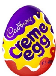
Cadbury crème egg

Which egg would you like for your carrot? Please tick ✓ in the box for your chosen egg