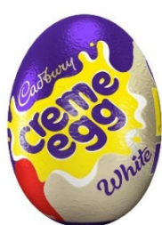
Cadbury white crème egg