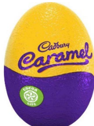
Cadbury caramel egg