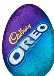
Cadbury Oreo egg